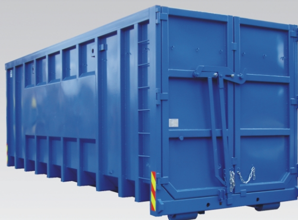
▲ MK 46FLP (LP - Logo plate version with a logo on the side walls)