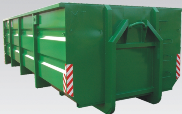
▲ MK 22 L